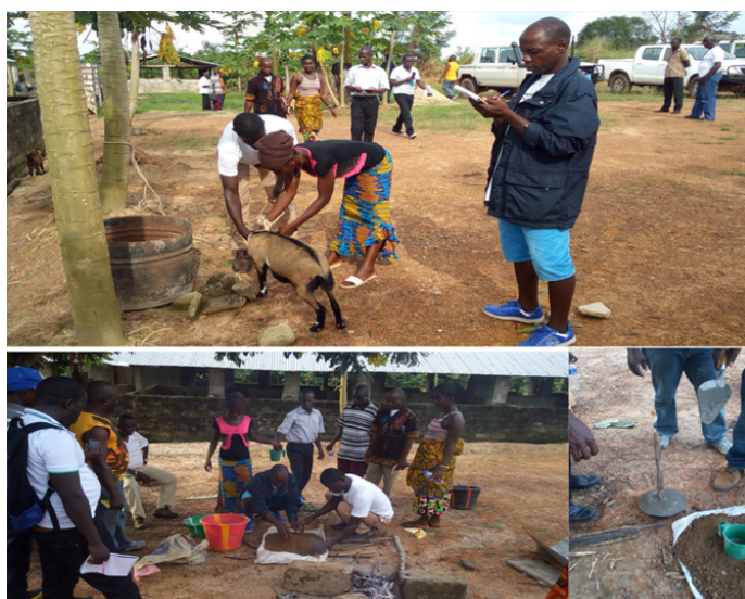
Figure 3 Goat evaluation and mineral lack preparation by CBBP farmers at CARI, Liberia.

Key: Criteria Score weight: 0.5=important or 1=very important; I=Yes: Present, 0=No: Absent; reflects status of group with respect to criteria; Selected: Recruited for piloting CBBP; Reserved: Earmarked for out-scaling