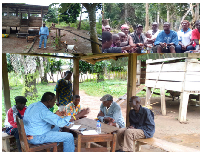
Figure 2 Farmer field visit: Above; National Project Coordinator at Kpiek Poah goat shelter; Farmers concentrating on focus group discussions: Below; Group discussions at Yawaseh.

The tool is composed of a table with various criteria depicting both necessary and important featured of a farmers' group. The criteria were weighed wither to have a strength of 1 denoting Necessary, or 0.5 denoting Important but not Necessary. Farmer groups were evaluated on whether they exhibited the criteria (1=Yes) or not (0=No) and the total score added objectively. Table 2 represents the CRM tool. The figures in column after the criteria denote the weight of the criterion. The CRM tool was designed to reduce bias in selection of CBBP farmers so as to allow the farmers to appreciate inherent qualities that are necessary for breeding programs. It is expected that farmers will learn from the information to improve their score. The results of this particular analysis are to be fed back to the farmers at the Training Workshop and during follow-up visits. The 5-day training workshop was scheduled from the 17 th to the 21 st of October 2016.