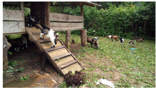
Figure 4 A typical West African dwarf goat at a goat shelter, Neepuah, Liberia.

Production system: The farmer groups practiced semi-intensive system, with night shelter and day grazing/browsing for goats. Goats are also supplemented at the shelter from cuttings of different browse feed (cut-and-carry). The health care support services are provided by the locally trained community health workers with assistance from the MOA County Livestock Officer. A typical goat shelter is shown in Figure 4.