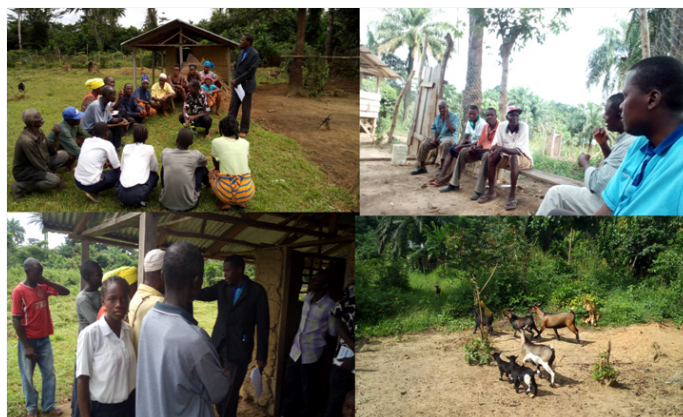
Figure 1 Farmer field visits. Clockwise: Kukatonon farmer group discussion; Kergeamah farmer group discussion; Grazing goats at Kergeamah goat shelter; Kukatonon farmers engaging the team.

During the deliberations on the importance of quality in goats and how quality must be preserved and multiplied as opposed to the selling of good animals that could reproduce and give out good offspring for sale and for breeding, one farmer remembered his experience with his Rooster, that was very productive and of higher quality than others that he sold to finance an emergent situation at that time, yet now he regrets because the rooster he has currently is performing very poorly. Figure 1 & Figure 2 show farmer groups visited and group discussions.